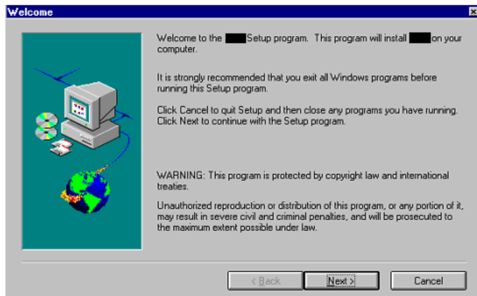
Figure 1-1: Add your own images and captions here.